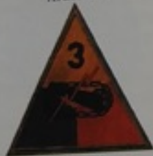
3rd Armor Battle of the Bulge, Houffalize, Ardennes, Hotton