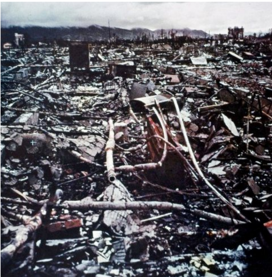
Scene of Hiroshima 800 yards from where A-bomb exploded.