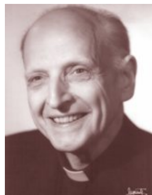
Father Arrupe, S.J.

Father Arrupe, S.J. was Ordained a Priest in 1936 and was sent to the United States for his doctoral studies in medical ethics. He was unexpectedly sent as a Missionary to Japan in 1939. He was the director for a group of Jesuit Novices living at Nagatsuka which was on the far outskirts of Hiroshima when the atomic bomb fell in 1945. As a physician of both body and soul he led the first rescue party to enter the devastation, building a makeshift hospital and utilizing his medical skills to serve the wounded and the dying.