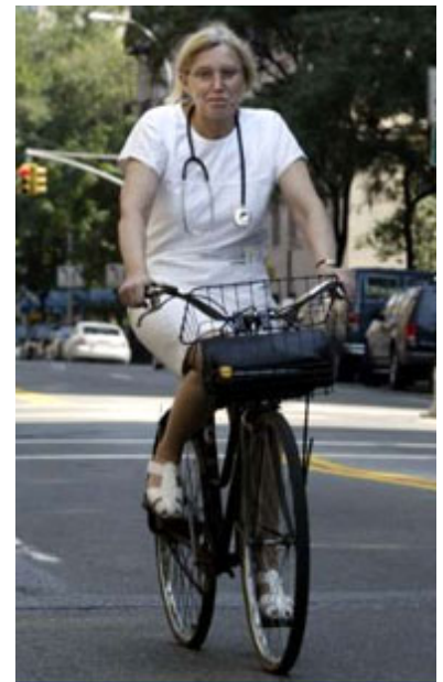
To the rescue